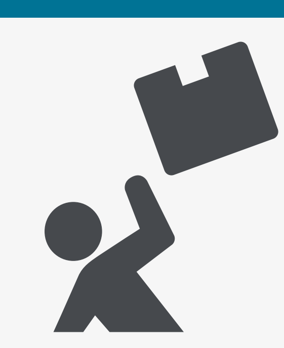
12% Struck by an object