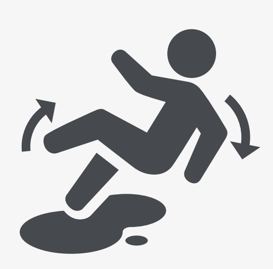
19% Slips, trips and falls