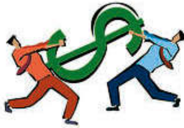
Chubb keeps property with $485,582 bid; Hanover gets liability coverage.