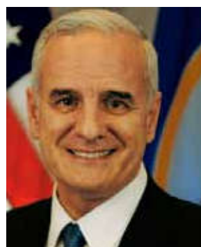
Gov. Mark Dayton

appointee—especially by a DFL governor—has been under scrutiny for something that has nothing to do with his insurance oversight. He is being scrutinized for an alleged lack of action in the scandal involving Community Action Minneapolis, a non-profit whose main goal is to provide money to help low-income people pay their heating bills. ➔